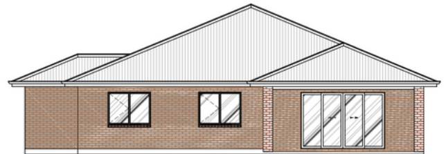
East Elevation E2.

Colours on Elevations are for drafting purposes only and are subject to change.