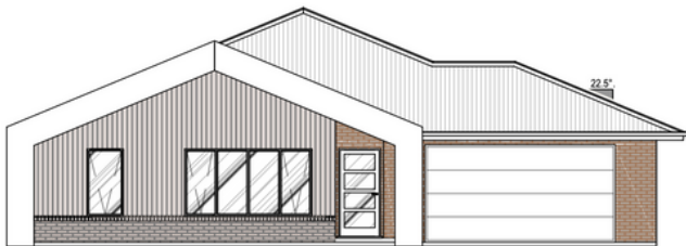
West Elevation E1.

Colours on Elevations are for drafting purposes only and are subject to change.