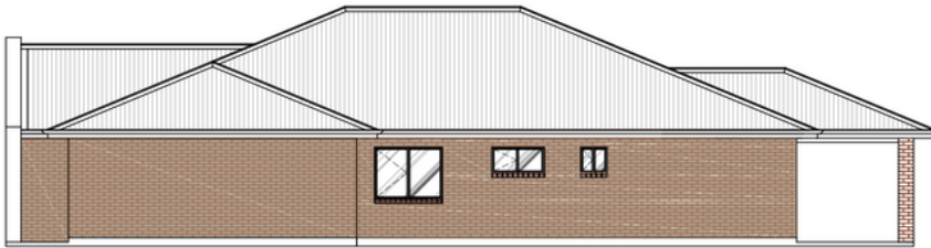
South Elevation E3.